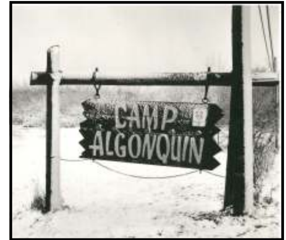
A Branch of the YMCA of McHenry County

Offering Quality Retreat, Education and Hospitality Services